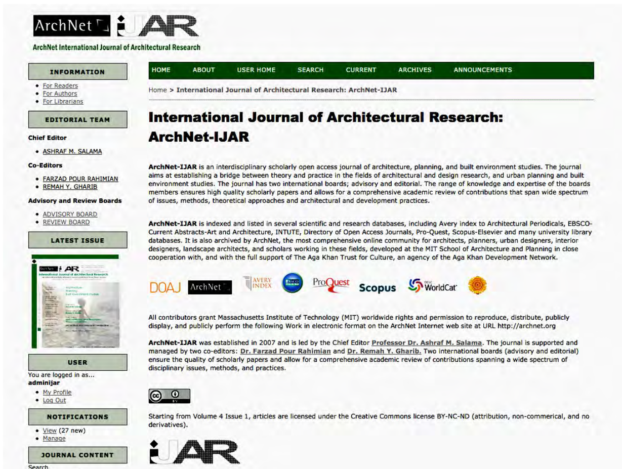
Figure 2: A screen image of the new website of the ~Archnet-IJAR—OJS ( http://www.archnet-ijar.net/ ).