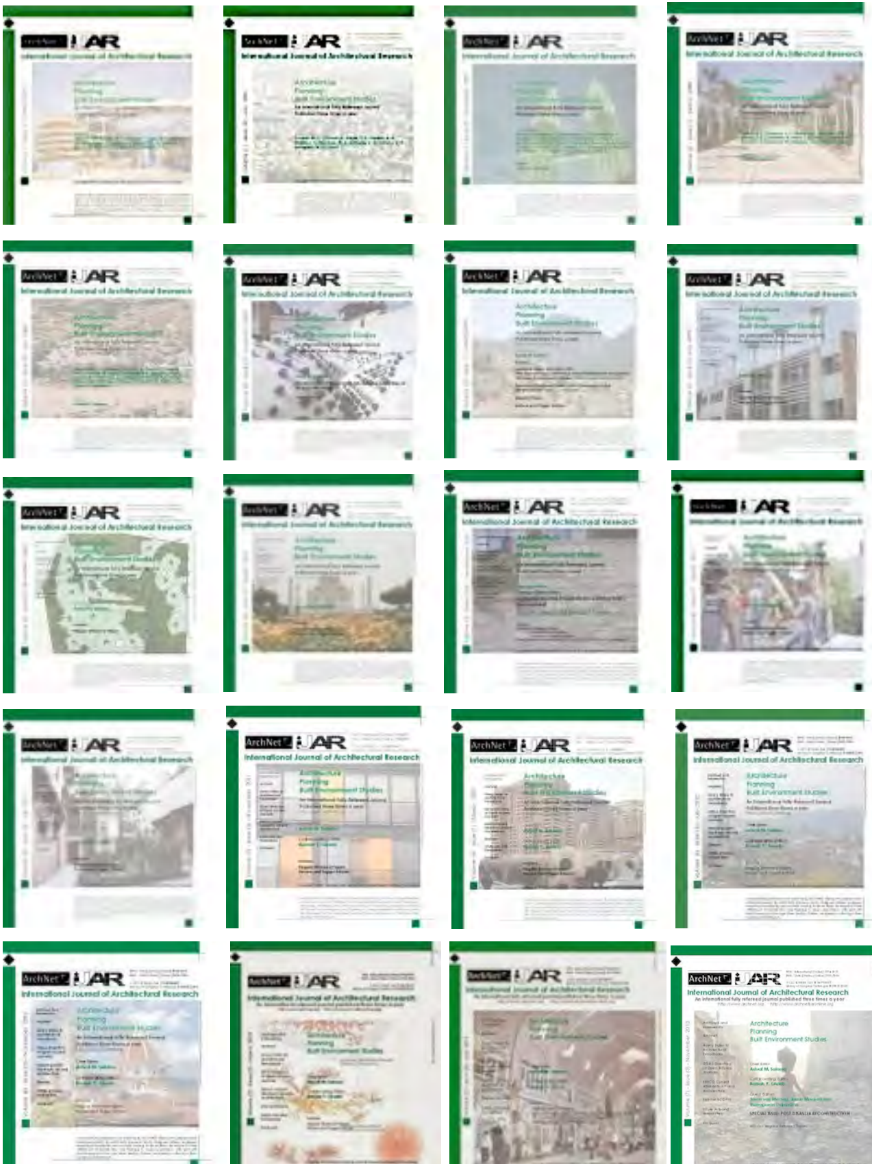
Figure 1: Archnet-IJAR Journal Covers from March 2007 to November 2014.